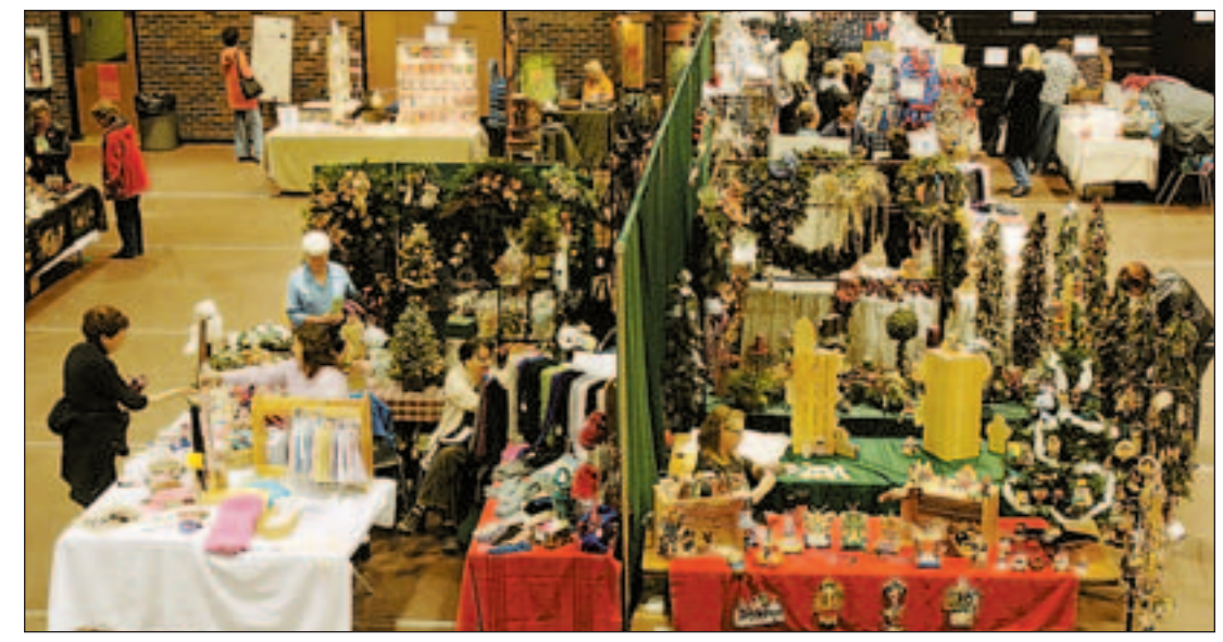
A few early birds check out the Mohawk College Holiday Village and Craft Show soon after artists began to work their magic at the Fennell campus.